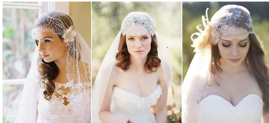
Juliet Cap Veil

Very popular with vintage or retro brides. As far as the length goes, the netting may come down to cover one or both eyes, down to the nose or chin, or even cover the entire face, whatever you feel most comfortable with. It's very statement-making and on trend.